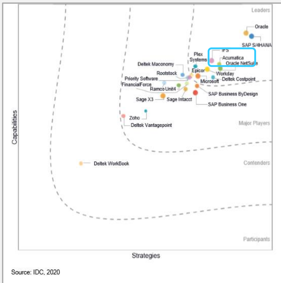
Source: IDC, 2020